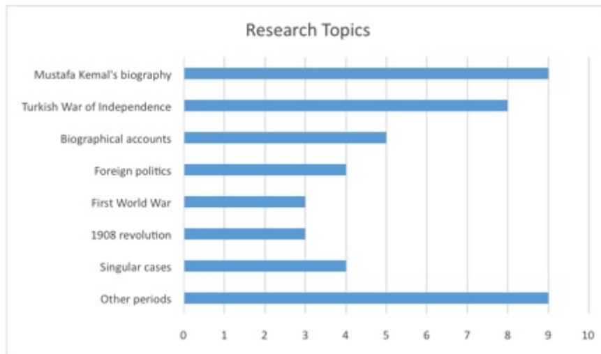
Figure 2: Mustafa Kemal's biography and the Turkish War of Independence are the most widespread research topics represented in the sample.

narrow sense of being person-centered and depended on the belief that single great individuals can – and, in fact, do – change and steer the course of history.